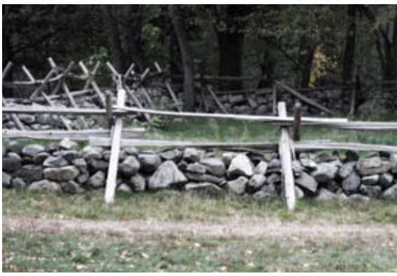
A split-rail and stone fence at Minute Man National Historical Park.

Stone was not their first choice of fencing material: Widespread use of it began only when other alternatives – stumps and split rails – grew scarce because of overclearing.<sup>[3]</sup>