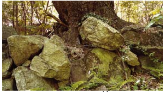
This pine tree pushes stones aside as it grows.<sup>[4]</sup>

Trees and stone walls do not mix. Yet because the damage often happens slowly, it is rarely noticeable until it's too late. Quietly adding an eighth of an inch in girth a year, a tree planted too close to a wall can grow enough to eventually knock part of it over. Plant accordingly, and remove volunteer saplings.<sup>[4]</sup>