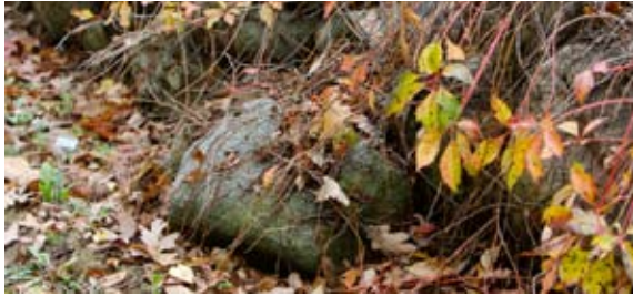
Vines covered the wall in front of Lincoln's Public Safety Building. These vines were later cut back by the Lincoln Garden Club.

Property owners and community members concerned about the well-being of walls in their vicinity should be mindful that the most important aspect of repair is prevention. It is best to monitor stone walls and detect problems as they develop, before major repairs and required. This includes keeping the wall free and clear of growth, other than lichen, because the root systems of vines and saplings can prove devastating to a wall's support and structure.<sup>[12]</sup>