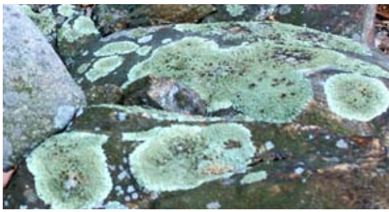
Lichens, part fungi and part algae, might help in dating the age of a stone wall. The crustose lichen grows about one millimeter a year.<sup>[4]</sup>